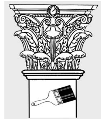
Fig. C – Apply a high quality primer before painting.