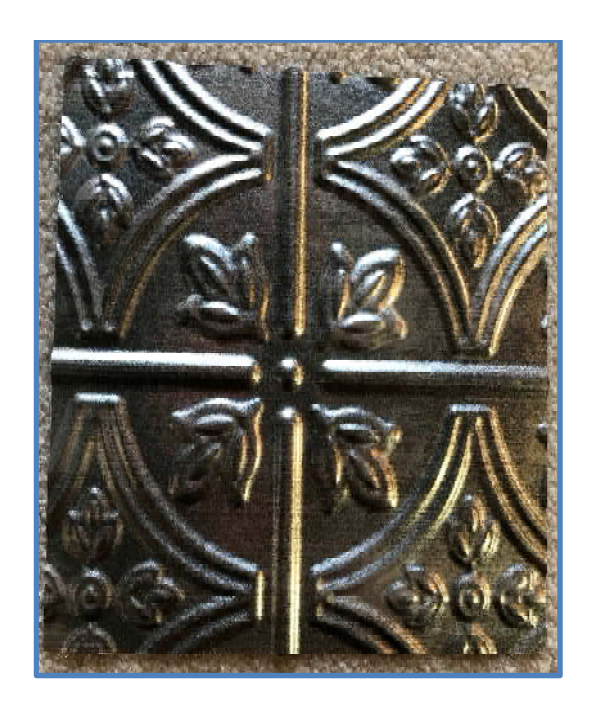
ATI Decorative Laminate

A decorative laminate from ATI was tested for compatibility with Oxivir 1, Oxivir Five 16, Oxivir TB, Avert, Virex Plus, and Virex TB. Wipe testing was performed on with Oxivir 1, Oxivir TB, and Avert while soak tests were performed on solutions of Oxivir Five 16, Virex Plus, and Virex TB. Visual assessment was used to evaluate compatibility. The substrate is as follows: